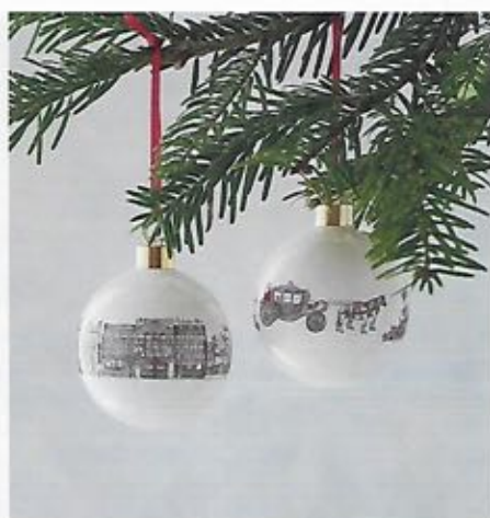
Royally British Bauble, Victoria Egg