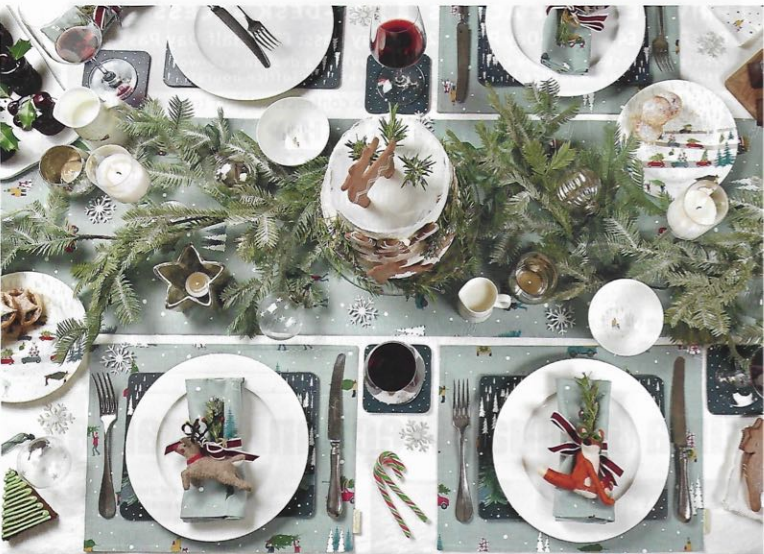
Home For Christmas Collection, Sophie Allport