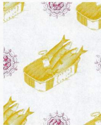
Sardines Wallpaper by Mind The Gap

limelace.co.uk decoville.co.uk giselagraham.co.uk essentialhome.eu tateanddarby.com pinterest.co.uk/curious_coco/ instagram.com/thecuriouscoco