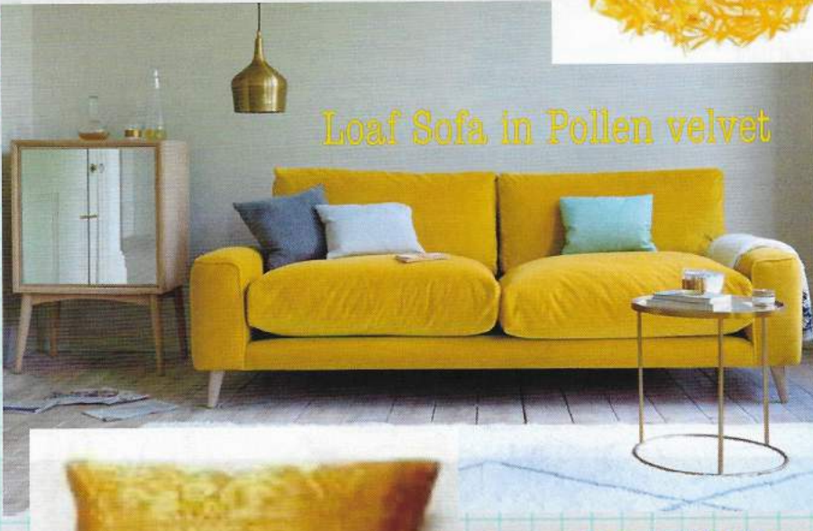
Loaf Sofa in Pollen velvet