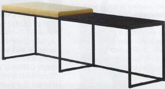
London Bench, BoConcept