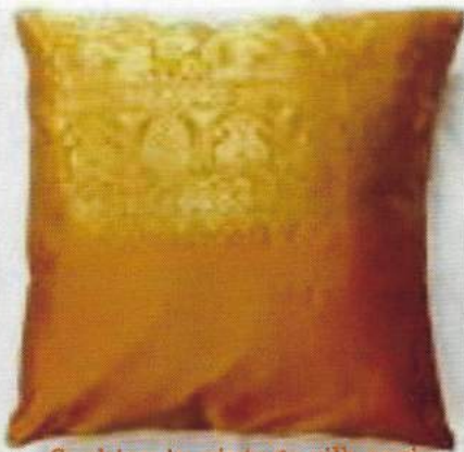
Cushion in vintage silk sari