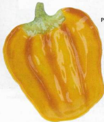
Pepper Plate by Gisela Graham