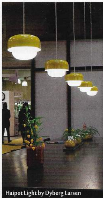
Haipot Light by Dyberg Larsen

It's such an easy colour to have fun with and even introduce some