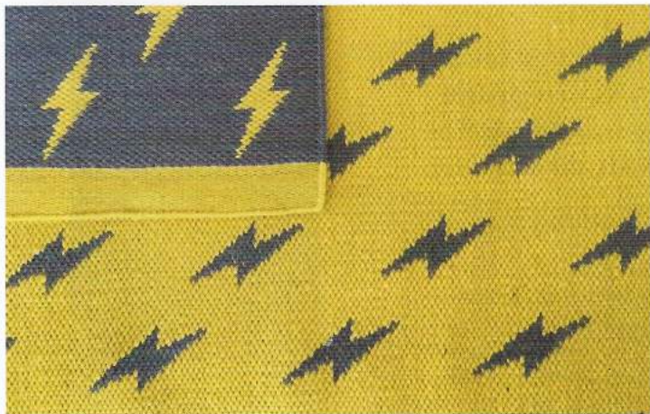
Lightning Bolts Rug by Tate & Derby