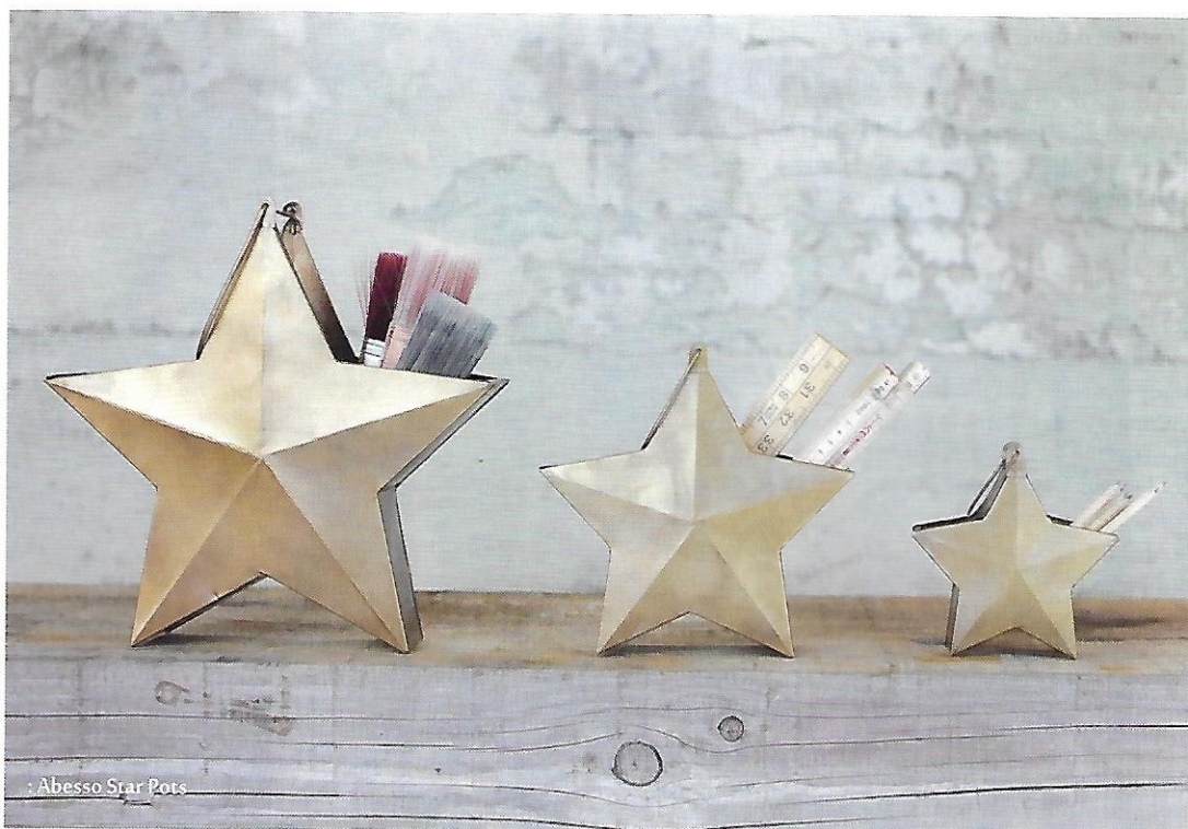
Abesso Star Pots