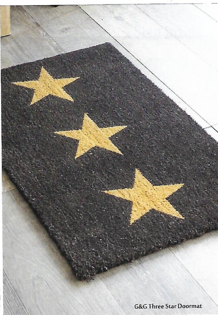
G&G Three Star Doormat