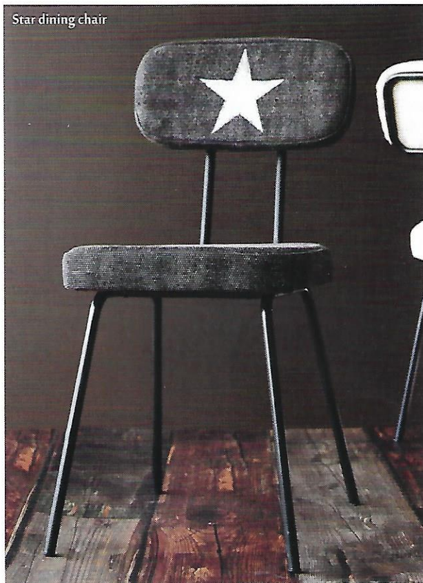
Star dining chair