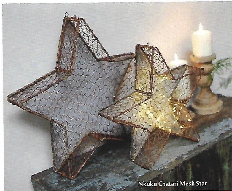
Nkuku Chatari Mesh Star

lights for a star shaped lamp, florists dried oranges for a scented Christmas decoration, small baubles would add reflective charm, or half fill with straw, top with toy animals and a manger et voila, a unique nativity scene. Or...think outside the 'star' and suspend mini tree